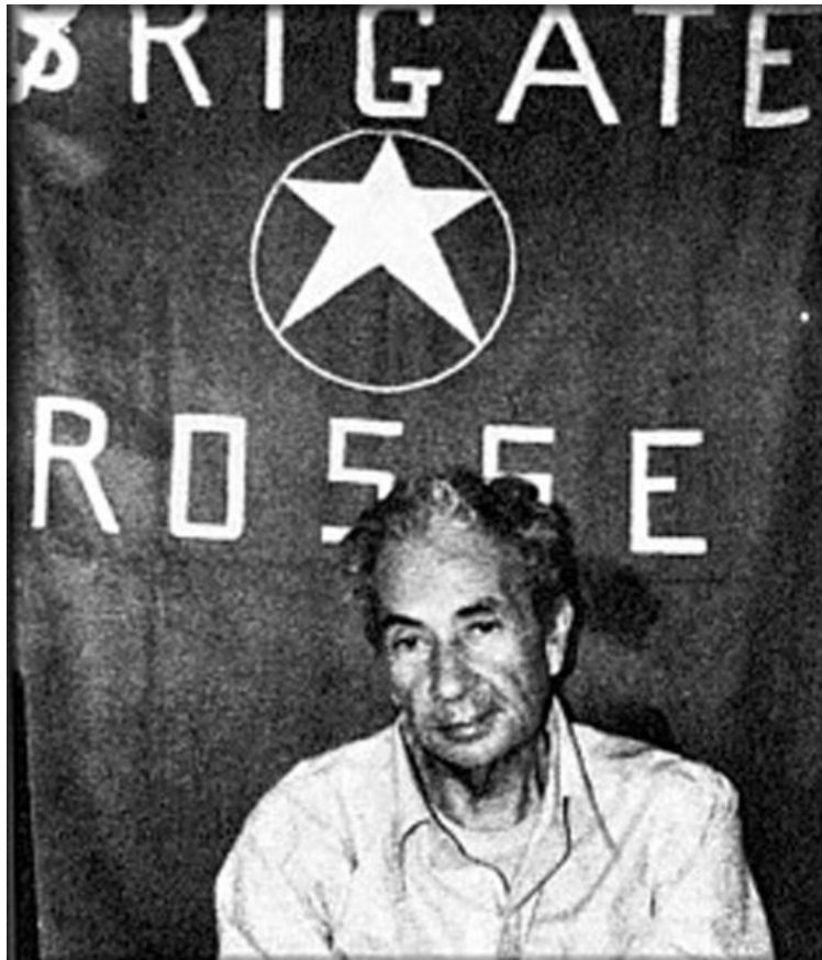
Doomed Italian PM Aldo Moro's photo while in captivity of the Red Brigades

On March 16th 1978, a unit of the leftist militant Red Brigades kidnapped Moro. He was on his way to a high-level meeting where he planned to give his blessing there to a new coalition government that relied on communist support, when the kidnapers violently extracted him from his convoy. Five of Moro's bodyguards were murdered in the process.