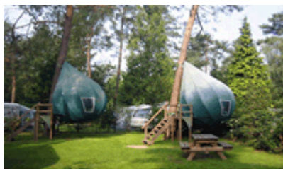
Leaked Prepper's Setup Becomes #1 Topic on the Web Watch VIDEO >>

The Mount Pinatubo eruption lowered temperatures by around 0.5°C across the Northern Hemisphere.