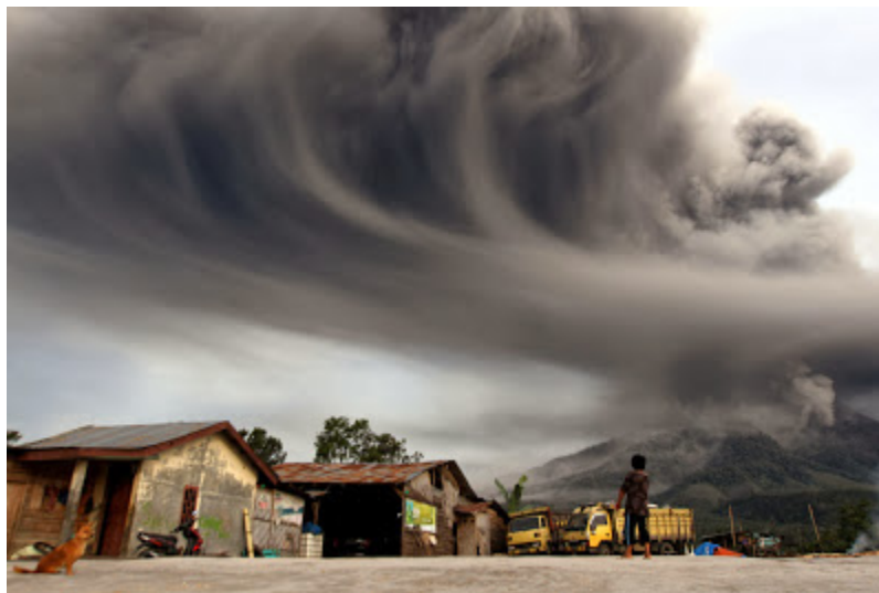
Mount Sinabung ash cloud

In Indonesia a four mile high ash cloud is making life hard for residents. Mount Sinabung came back to life in 2010 after dormancy of hundreds of years. Occasionally coming to life after its 2010 awakening, the rumbling of the volcano prompted the evacuation of over 6000 people as scientists feared a major eruption. There has been no lava flows so far but the ash cloud is growing.