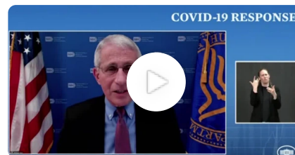
J&J pause shouldn't prompt vaccine hesitancy: Fauci