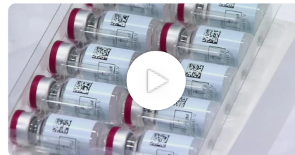
Fauci believes J&J vaccine will 'get back on track'