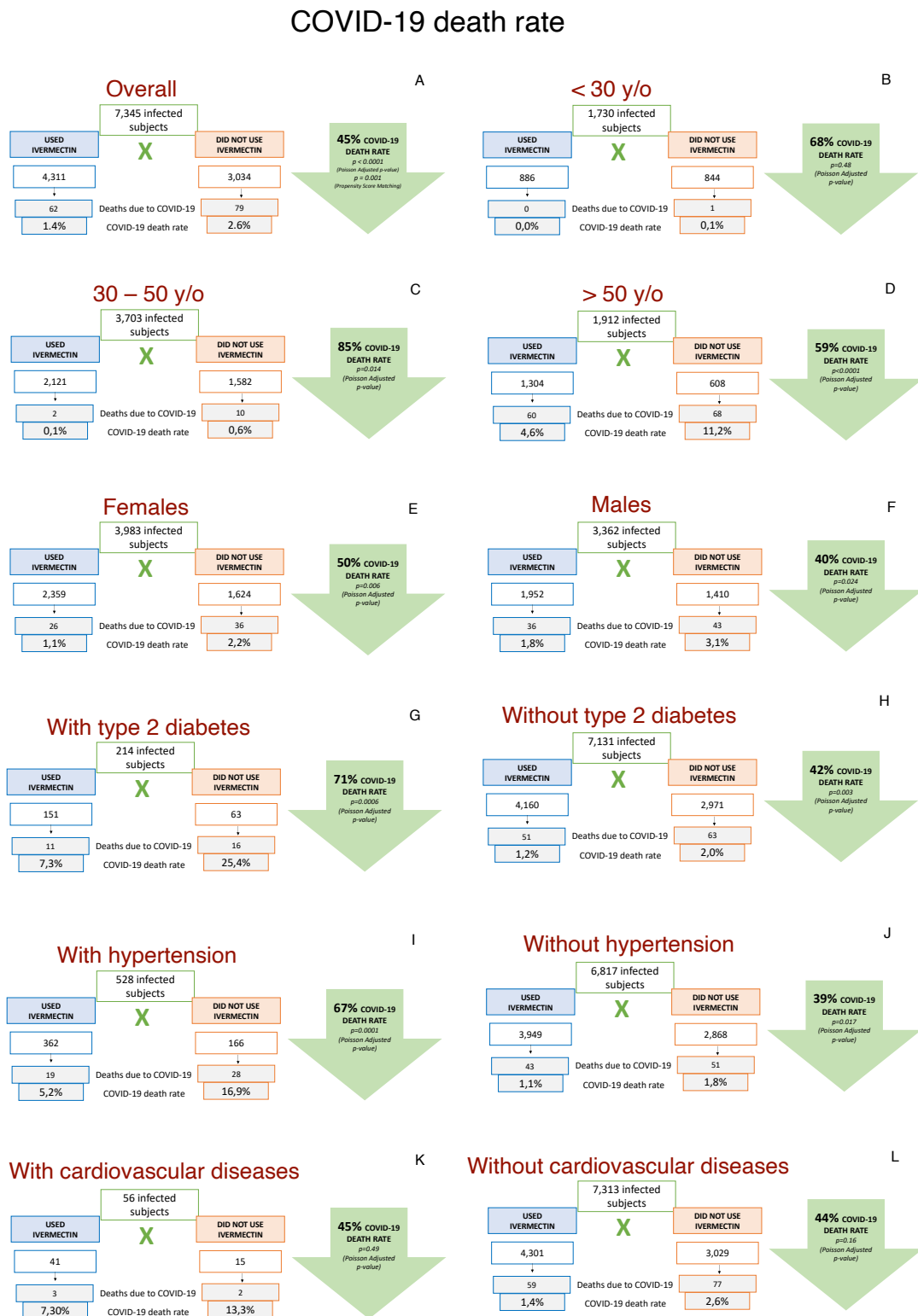
Figure 2. COVID-19 death rates in subpopulations.

A = Overall population; B = Below 30 years old (y/o); C = Between 30 and 50 y/o; D = Above 50 y/o; E = Females; F = Males; G = With type 2 diabetes; H = Without type 2 diabetes; I = With hypertension; J = Without hypertension; K = With cardiovascular diseases; L = Without cardiovascular diseases