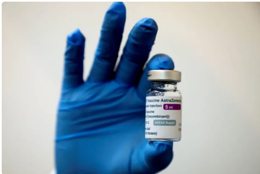
FILE PHOTO: A medical worker holds a bottle of AstraZeneca's COVID-19 vaccine in this file photo