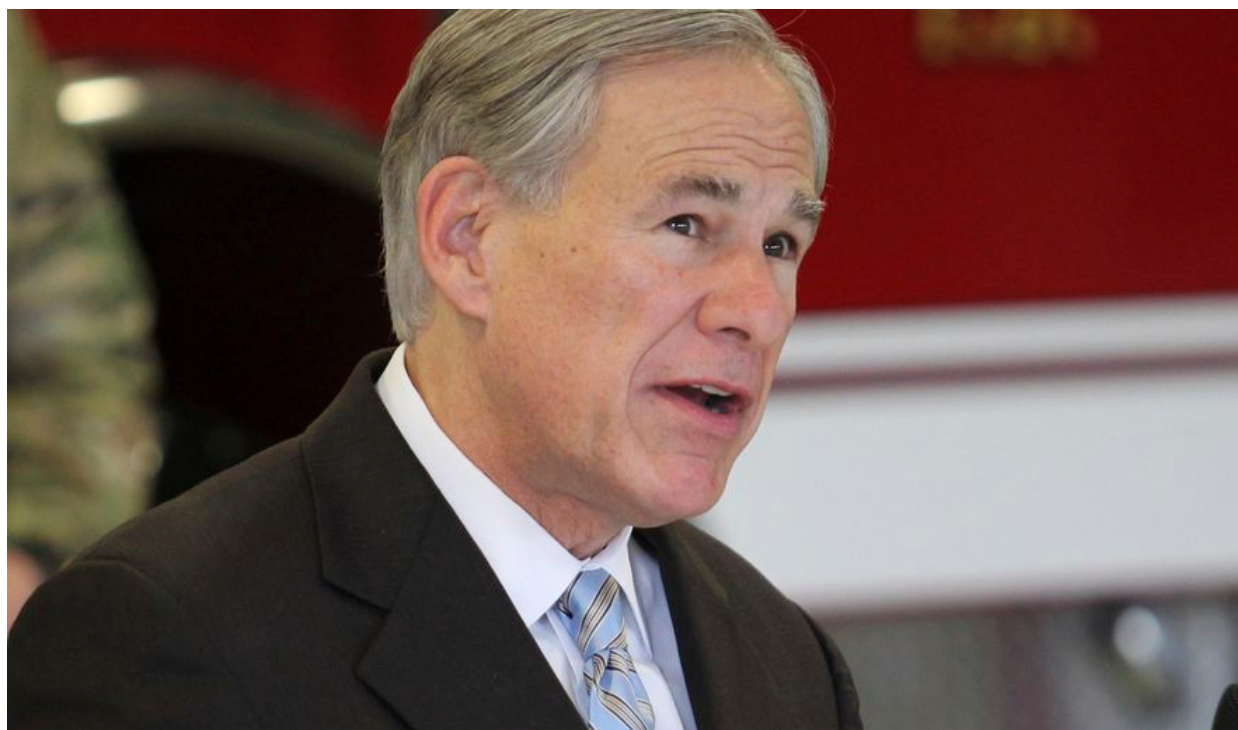
Texas Gov. Greg Abbott speaks at a news conference on the "Save Our Seniors" initiative at McAllen Central Fire Station on Thursday, March, 25, 2021 in McAllen, Texas. more >