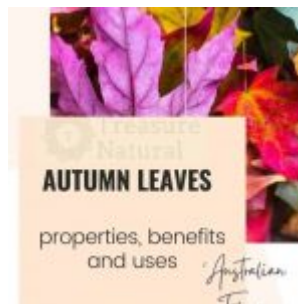
Australian Flower Essences and Remedies