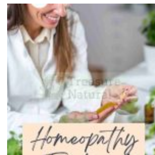
Homeopathy Treatment and Remedies