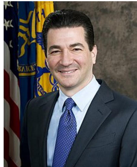
Commissioner of Food and Drugs