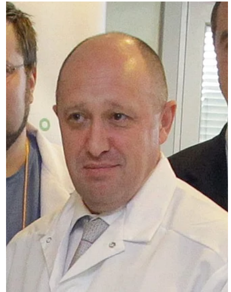
Prigozhin in 2010

Hero of the Russian Federation Yevgeny Prigozhin