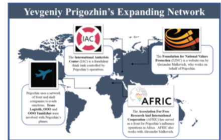
"Yevgeniy Prigozhin's expanding network" per U.S. Treasury Department (2021)