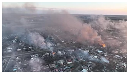
Bakhmut in April 2023. At the end of April, Prigozhin said that his forces were losing around 100 men a day.