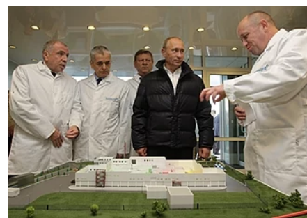
Touring the Concord Catering factory in 2010. Left to right: Presidential envoy to the Northwestern Federal District Ilya Klebanov , Chief Sanitary Inspector Gennady Onishchenko , Leningrad Region Governor Valery Serdyukov , Prime Minister Vladimir Putin , Concord factory director Yevgeny Prigozhin

Suspended sentence (1979) 12-year imprisonment (served 1981-1990)