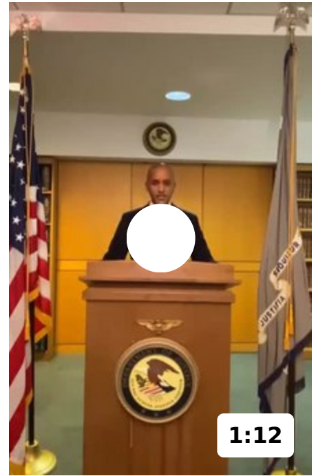
Damian Williams, United States Attorney for the Southern District of New York , gives a statement following the conviction of Ghislaine Maxwell.

On 28 June 2022, Maxwell was sentenced to 20 years in prison; [150] prosecutors were seeking a sentence of at least 30 years. [151] She complained of threats coming from jail staff in the days prior to sentencing, but gave no details about the nature of the threats. Although she had been placed on suicide watch on 24 June, [152][153] she told the psychiatric team that she was not suicidal. A related request by her lawyers for a sentencing delay was denied. [154] She appealed the conviction on 7 July. [155] On 25 July 2022, Maxwell was transferred from Metropolitan Detention Center, Brooklyn to a low security federal prison for female inmates at FCI Tallahassee . [156] In August 2022, her former lawyers sued Maxwell, alleging that she failed to pay $878,000 in legal fees. [157]