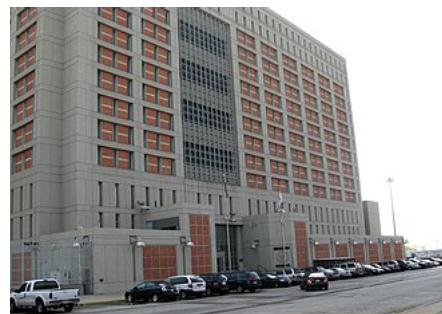
Metropolitan Detention Center, Brooklyn

On 26 January 2021, a motion by Maxwell's attorneys challenged her grand jury indictment, claiming that it did not reflect the ethnic diversity of the jurisdiction in which the violations of the law were alleged to have occurred. [126]