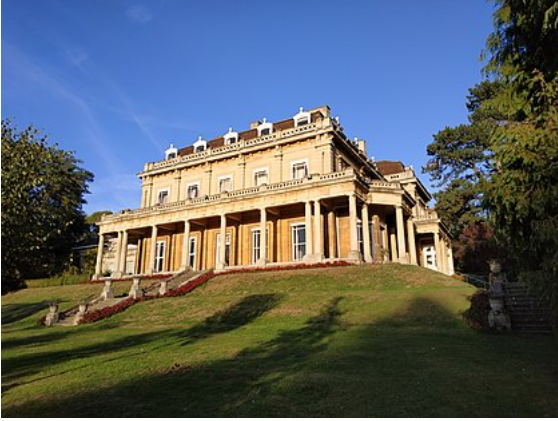
Headington Hill Hall, Oxford