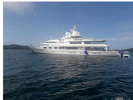
The Dancing Hare yacht, formerly known as the Lady Ghislaine

Maxwell had a romantic relationship with Epstein for several years in the early 1990s and remained closely associated with him for more than 25 years until his death in 2019. [23][49][52] The nature of their relationship remains unclear. In a 2009 deposition, several of Epstein's household employees testified that Epstein referred to her as his "main girlfriend" who also hired, fired, and supervised his staff, starting around 1992. [53] She has also been referred to as the "Lady of the House" by Epstein's staff and as his "aggressive assistant". [54] In a 2003 Vanity Fair profile on