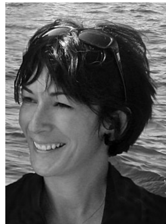
Maxwell in 2007

By late 2015, Maxwell had largely retreated from attending social functions. [10][64]