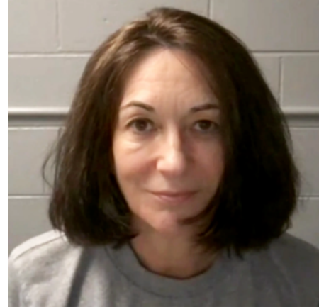
Maxwell in a mug shot taken at the Metropolitan Detention Center, Brooklyn