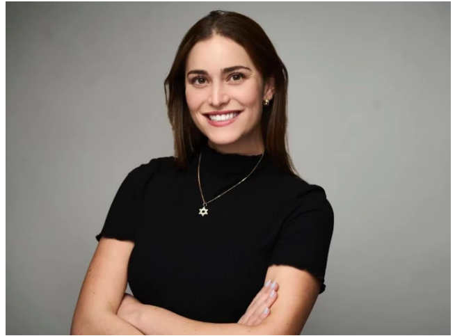
Suing NYU: Fighting Antisemitism on Campus 6 min read