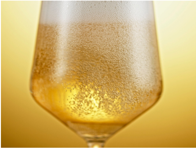
Champagne and the Deeper Meaning of Hanukkah 5 min read