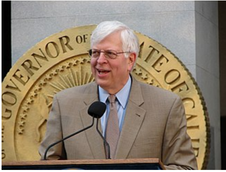
Prager speaking at the California Capitol Building in 2008

In 1969, while he was studying in England, he was recruited by a Jewish group to travel to the Soviet Union to interview Jews about their life there. When he returned the next year, he was in demand as a speaker on repression of Soviet Jews; he earned enough from lectures to travel, and