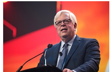
Prager speaking at a Turning Point USA event in 2020

Prager supported Jimmy Carter in the 1976 US presidential election. [23] In 1994, the Anti-Defamation League published a report on antisemitism in the Christian right movement; Prager, who aligned with the social and political conservatism of the Christian right, attacked the ADL and its report. [24] In 1995, he urged conservative Jews to be open to working with conservative Christians, like the Christian Coalition . [25] In 1995, he named Jacob Petuchowski , Eliezer Berkovits , Harold Kushner , C.S. Lewis , Richard John Neuhaus , Michael Novak , and George Gilder as the people who had influenced his theology the most. [26]