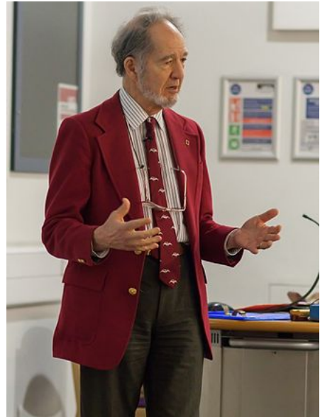
Diamond in 2013