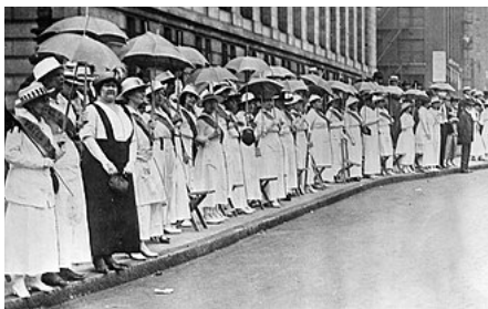
The Golden Lane