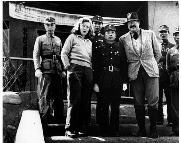
Gellhorn and Ernest Hemingway with General Yu Hanmou , Chongqing, China, 1941

In June 1944, Gellhorn applied to the British government for press accreditation to report on the Normandy landings ; her application, like those of all female journalists, was denied. Lacking official press credentials, she posed as a nurse and was allowed onto a hospital ship where she promptly locked herself in a bathroom. Upon landing two days later she saw the many wounded and became a stretcher-bearer. [15] Later she recalled, "I followed the war wherever I could reach it." She was the only woman to land at Normandy on D-Day on 6 June 1944. [16]