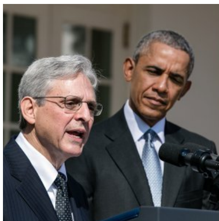
Garland with President Barack Obama in 2016

On February 13, 2016, Supreme Court Justice Antonin Scalia died. [81] Later that day, Senate Republicans led by Majority Leader Mitch McConnell issued a statement that they would not consider any nominee put forth by Obama, and that a Supreme Court nomination should be left to the next president of the United States. [82][83][84] President Obama responded that he intended to "fulfill my constitutional duty to appoint a judge to our highest court," [85][86] and that there was no "well established tradition" that a president could not fill a Supreme Court vacancy during their last year in office. [87]