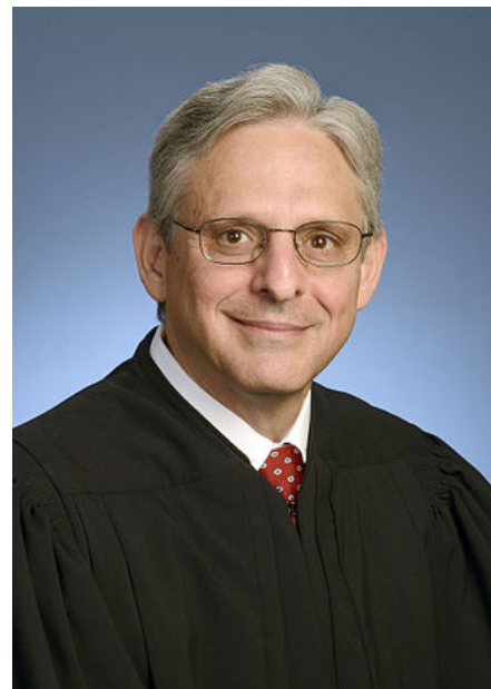
Garland in 2016 as chief judge of the U.S. Court of Appeals for the D.C. Circuit