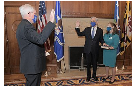
Garland is sworn in as Attorney General in March 2021.