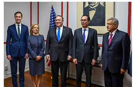
Mnuchin, Secretary Pompeo , Secretary Nielsen and Advisor Kushner with Mexican president-elect López Obrador , July 13, 2018