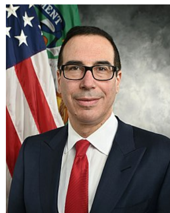
Mnuchin's first official secretary portrait