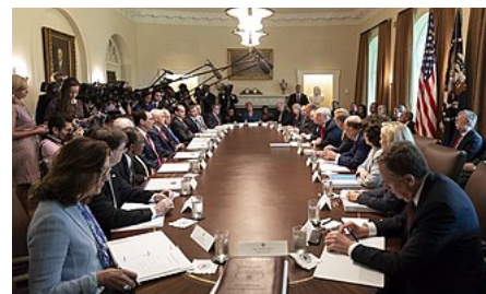
Cabinet meeting in August 2018

In May 2018, Mnuchin instructed his staff to accept a non-low-income tract in Storey County, Nevada , as an Opportunity Zone shortly after attending a Milken Institute event in Beverly Hills