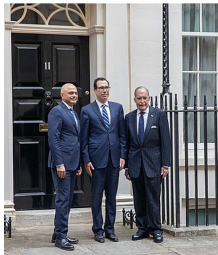
Mnuchin, Larry Kudlow and Sajid Javid at 11 Downing Street, 2019

Mnuchin is a member of the so-called "Big Six", a group of politicians convened to write a tax