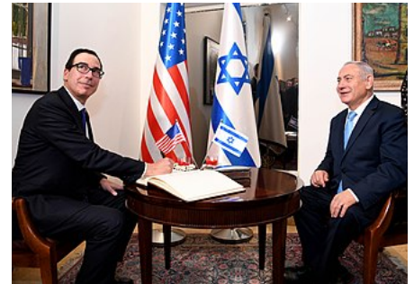
Mnuchin led the U.S. delegation to Israel in May 2017 for the inauguration of the newly relocated U.S. embassy in Jerusalem .

In the August 2017 Unite the Right rally in Charlottesville, Virginia, opposing the removal of Confederate statues, protesters included neo-Nazis and Klansmen, leading to violent conflicts. President Trump said there was "blame on both sides". Several hundred of Mnuchin's Yale classmates drafted a letter urging him to resign from the administration in protest. [99] Mnuchin