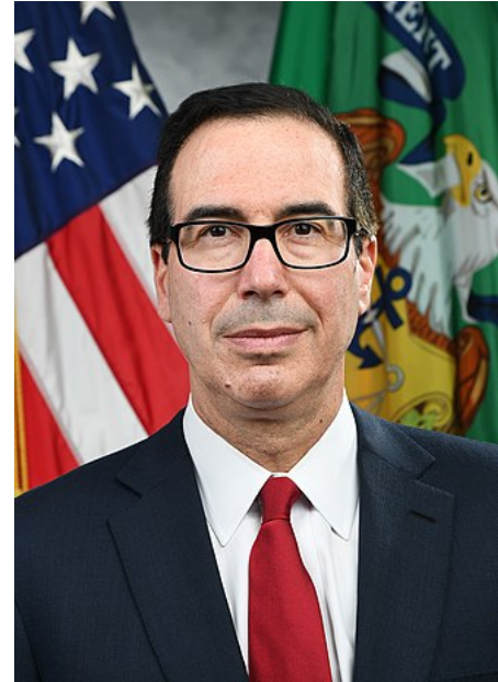
Official portrait, 2018