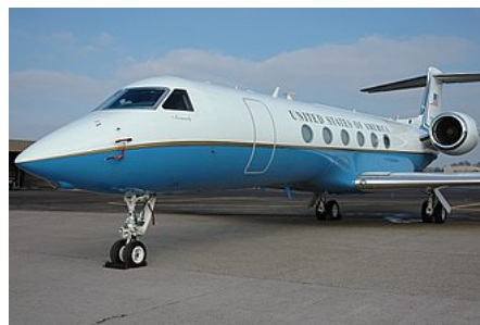
Gulfstream Aerospace C-37A (Gulfstream V), photographed in 2005

During the OIG's investigation into Mnuchin's use of government aircraft, it was revealed that Mnuchin had requested a military jet for his honeymoon travel to Europe in June 2017. Mnuchin stated that, as a member of the United States National Security Council , he needed access to secure communications during his honeymoon, but withdrew his request for the military jet after an alternative was identified. [111] Mnuchin stated: "I'm very sensitive to the use of government funds. I've never asked the government to pay for my personal travel ... The story [regarding the honeymoon travel request] was quite misrepresented." [108] The OIG investigation also showed Mnuchin had taken a USAF C-37A , the military designation of the Gulfstream V , to return from New York to Washington on August 15 after flying to New York commercially. Although the request for travel on the military jet was initiated by Mnuchin's office, the aircraft had previously been used to fly Transportation Secretary Elaine Chao from Joint Base Andrews to Teterboro Airport . Mnuchin's return flight lasted less than an hour and had an operating cost of at least $25,000. [112]