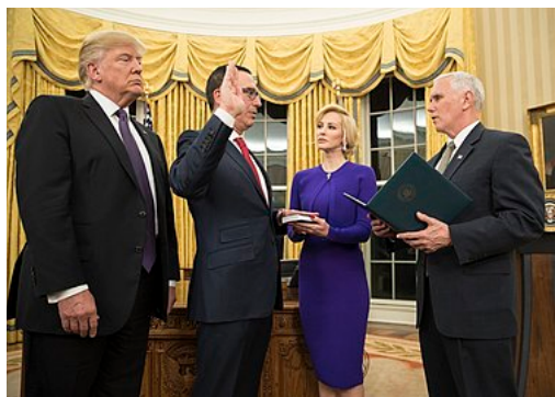
Mnuchin being sworn in at the Oval Office

On November 30, 2016, Donald Trump announced on his website that he would nominate Mnuchin as United States Secretary of the Treasury . [15] In the statement, Trump called Mnuchin a "world-class financier, banker, and businessman", and he said Mnuchin played an important role in developing his "plan to build a dynamic, booming economy". Mnuchin himself said he was "honored to have the opportunity to serve our great country in this important role". He called Trump's economic agenda a "bold" one "that creates good-paying jobs and defends the American worker". [15]