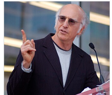
David in December 2009

The show is based on David's life following the fortune he earned from Seinfeld ; semi-retired, he strives to live a fulfilled life. [44] Alongside David is his wife Cheryl (Cheryl Hines), his manager and best friend Jeff (Jeff Garlin), and Jeff's wife Susie (Susie Essman). Celebrities, including comedians Richard Lewis , Wanda Sykes , and Bob Einstein , appeared on the show regularly. Actors